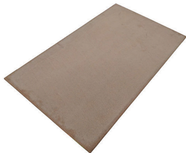
ACN60 / TD1049 Premium Nitrile Cork