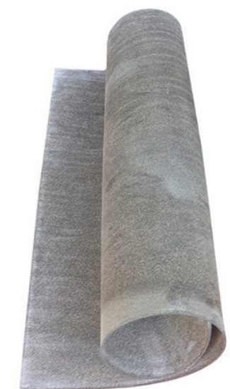
TD1150 Transformer Grade Cork