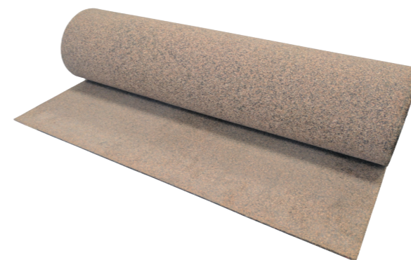
MR31 Industrial Grade Cork